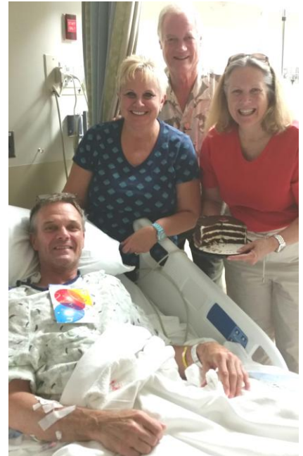
Happy Birthday! 7/3

TRUST: Now I feel the pain of cancelled summer plans, the challenges of a long recovery, and big changes for this fall. But God is in the ring with me. He is working in many ways through what seems like a "shipwreck".